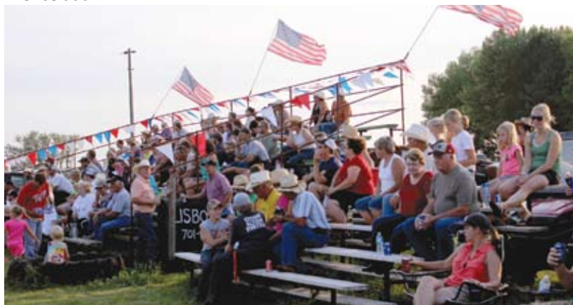
A good-sized crowd enjoyed the 11th Annual Cowboy Up Ride Against Cancer events including the Extreme Race and Ranch Rodeo Friday, August 14. More events and trail rides were enjoyed by many in spite of 90-degree temperatures over the weekend. More photo coverage on page 2 and online at www.Facebook.com/VE-News . More Cowboy Up in the Sept. VEN issue.

Enjoy the August issue of the Valley Equestrian News, all the images of Sodbuster Days, the horses and old equipment used with a lot of hard work and sweat. Support the work of the Ft. Ransom Sodbuster's Association so we will be able to continue to enjoy the living heritage that group and others like them bring us.