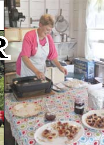
Below: Horses at the windmill generated watering hole. Far left: Sack races. Middle left: Making jelly bismarcks in the summer kitchen.