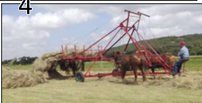
Group 3: Clint Sweet, Lisbon, N.D. is hooking hay slings to carrier to lift hay into barn. Group 4: Duane Pfeifer of Devils Lake, N.D. operates the Jayhawk hay stacker used to build a hay-stack. Machine has a mechanical lift to put hay up on stack.